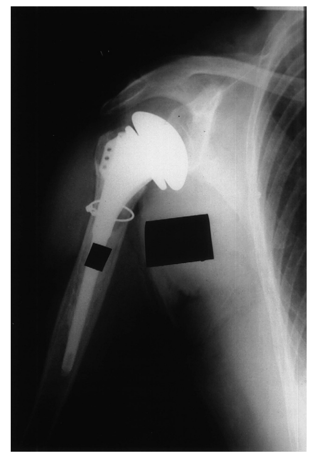
Figure 2 Three-month postoperative radiograph of a type I fracture which occured intraoperatively. The fracture was treated with cerclage wiring.

Three fractures occurred proximal to the tip of the prosthesis. Two fractures occurred intraoperatively and 1 fracture occurred 2 years postoperatively. One fracture recognized intraoperatively was treated with intraoperative cerclage wiring of the prosthesis (Figure 2). The other intraoperative tracture was not recognized until seen on postoperative radiographs. The component was stable and the fracture alignment acceptable.<sup>12,17</sup> A fracture orthosis was selected for treatment. The last fracture occurred postoperatively. Again, the component was stable and the fracture in acceptable alignment. A fracture orthosis was chosen as treatment. Postoperative rehabilitation was unchanged in all three patients from a standard primary procedure.<sup>7</sup> All patients were placed on an immediate range of motion program. All tractures healed, and no prosthesis was removed for loosening or infection. Union of the fracture occurred at an average of 7 weeks (range, 4-8 weeks). Forward elevation averaged 125° for this group (range, 90-165°).