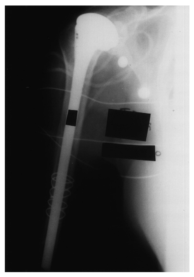
Figure 4 Immediate postoperative radiograph of type III fracture which occurred intraoperatively; treated with long stem prosthesis and cerclage wires.