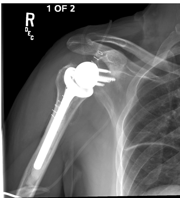
A postoperative x-ray of right reverse total shoulder viewed from the front

Surgery is typically performed with a nerve block and supplemental anesthesia. Surgery typically requires less than two hours and the risks of blood transfusion are 1% in most studies. The need for medical prevention of deep vein clots after surgery is controversial and ranges from none, to aspirin, to mechanical compression to blood thinning agents. Other standard risks associated with surgery and arthroplasty are applicable to these types of procedures.