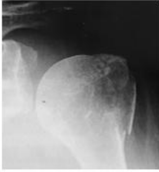
1. Greater tuberosity fracture