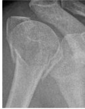
2. Displaced surgical neck of humerus fracture XR and CT 3D reconstruction